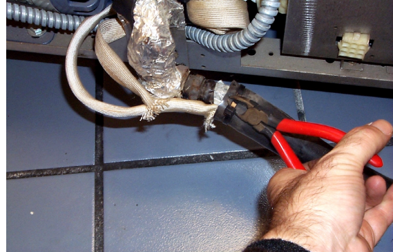
Figure 1: Cut tie wraps securing plastic sheathing to oil return line.

* 826-1668 is for 120V units; *826-1669 is for 240V units.