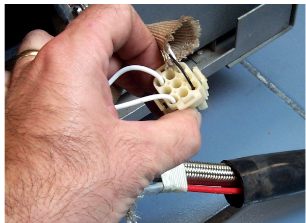
Figure 3: Identify leads from heater tape to wire junction block. Use pin pusher to disconnect failed heater tape. Pull failed heater tape from sheathing.